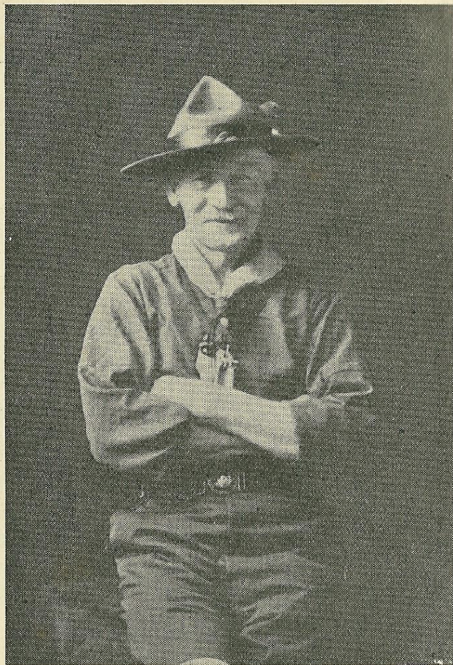
LORD BADEN-POWELL OF GILWELL 1857-1941